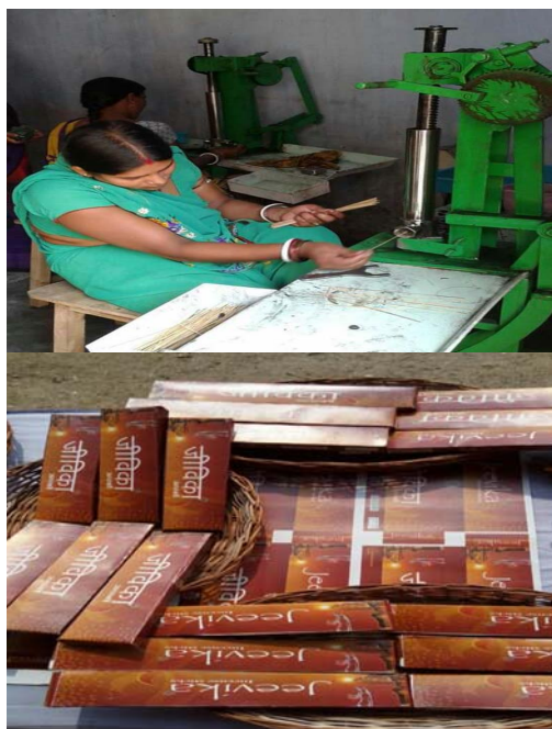
Figure: A mechanized unit in Dobhi (Left) and packaged and scented incense stick produced by community (below)

The strategy to shift from the production of hand-rolled Agarbatti to mechanized Agarbatti production is being adopted owing to the inclination of market demand towards mechanized Agarbatti. Further, this method of production is less labour-intensive and time consuming. An average of 5-7 percent of increase in production has been observed through the semi-automated units.